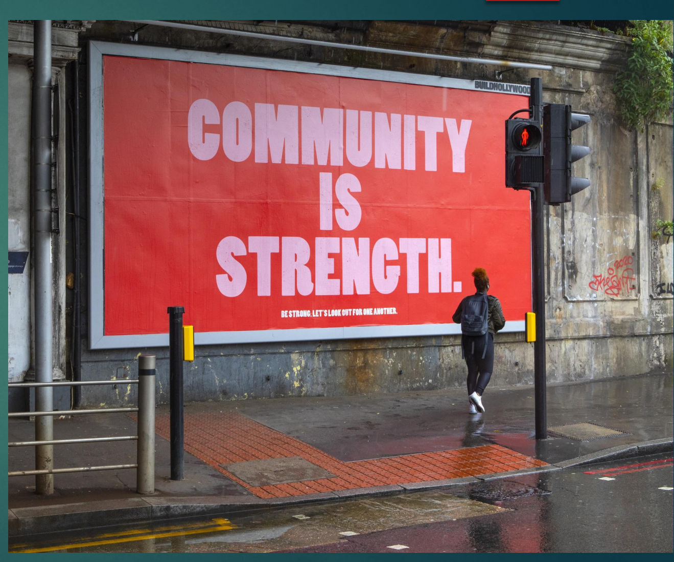
"Be strong. Let's look out for each other."