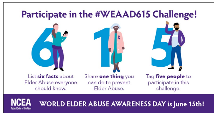
615 Challenge shareable graphic